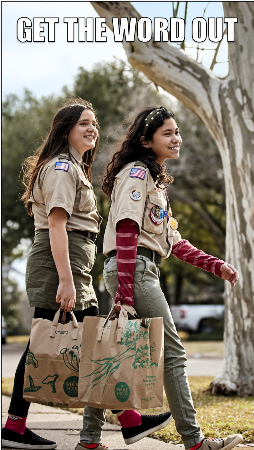
Black Swamp Area Council